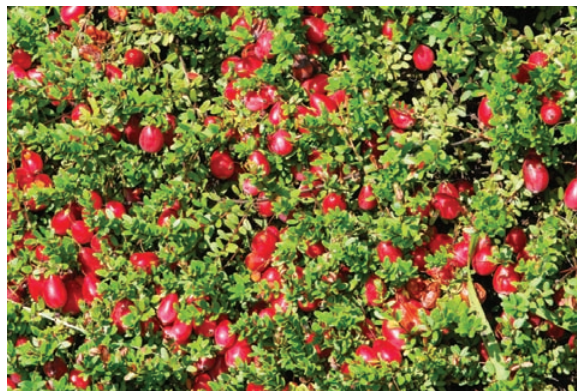
Figure 1. Vaccinium macrocarpon

uroepithelial cells by proteinaceous appendages called fimbriae. 2 E. coli adheres to uroepithelial cells via type 1 pili – long, hairy-surface organelles with a mannose-binding FimH, which is a protein component at the fimbriae end that acts as an adhesive. 18 Bacterial attachment results in a cascade of events involving elaboration of interleukin-6 and -8, which influences leukocyte infiltration. 2