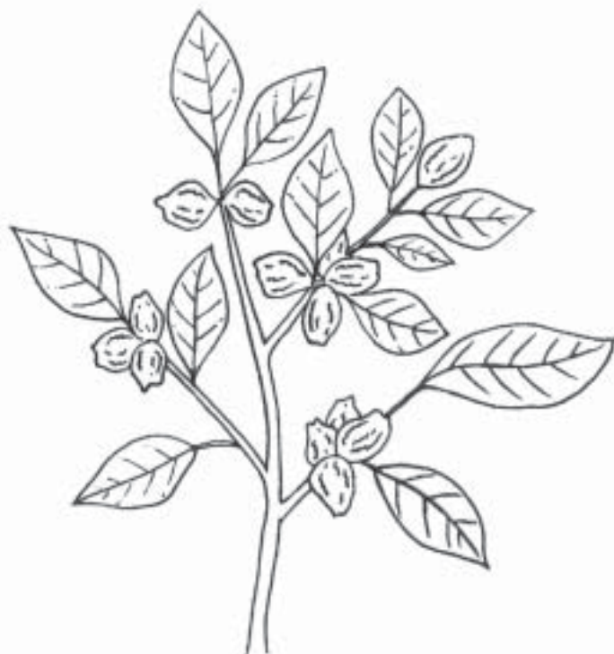
Withania somnifera (Ashwagandha)

its use in inflammatory arthritis, 3-6 and animal stress studies have been performed to investigate its use as an antistress agent. 7-10 Several studies have examined the antitumor and radiosensitizing effect of WS. 11-15 The purpose of this paper is to review the literature regarding WS and report on clinically relevant studies, in an attempt to establish a scientific basis for the therapeutic use of WS. Results of studies investigating the chemistry and toxicity of WS will also be discussed.